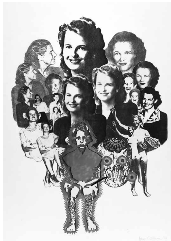
Joanne Oldham, Too many mummies, no room for me. , 1993, cut paper, colored pencil, 22 x 15 3/4 inches

wo: The works can only be contextualized in my own practice, insofar as the works are things that I hope to find sustainable, and more nourishing, possibly, through proximity.