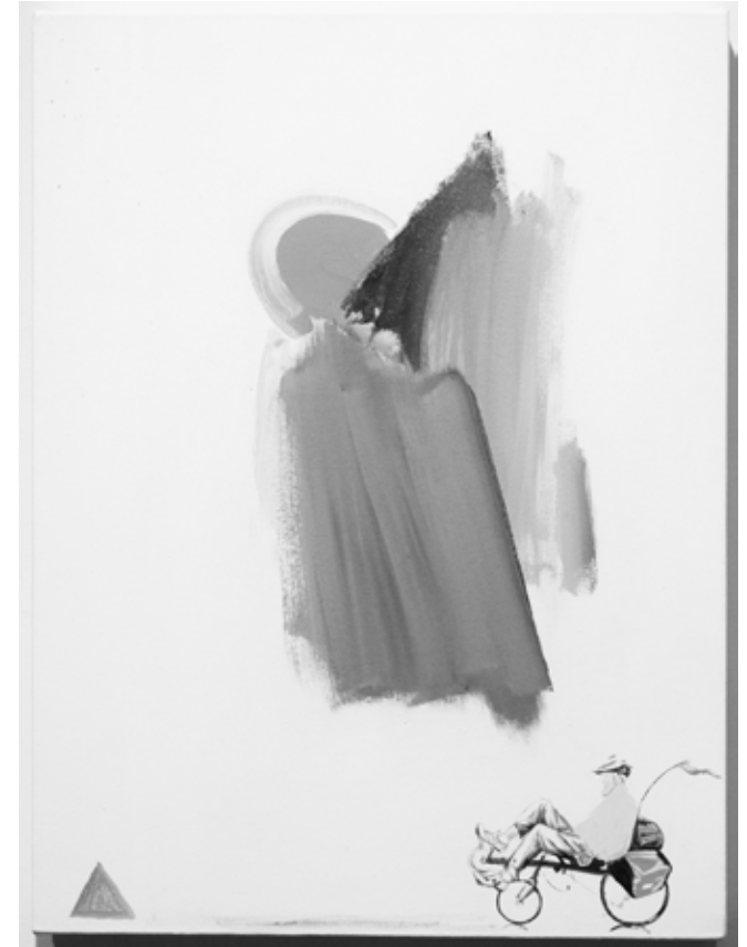
Spencer Sweeney, tbc , 2009, acrylic on canvas, 24 x 18 inches

AA: What do you expect from the exhibition?