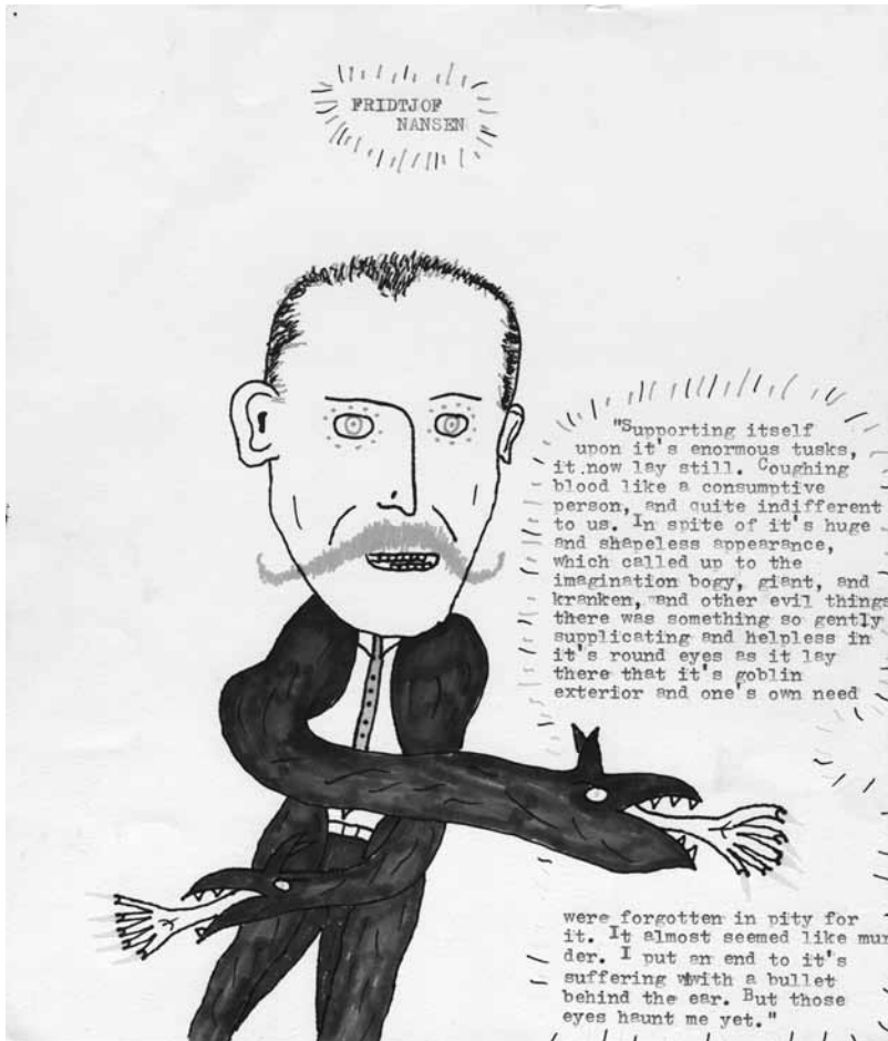
Able Brown, Fridtjof Nansen, 2009, ink, watercolor and typewriter ink on paper, 9 1/2 x 8 inches

AA: When I first asked you about doing something at Fleisher/Ollman, you said it was a very interesting proposal. What about it appealed to you?