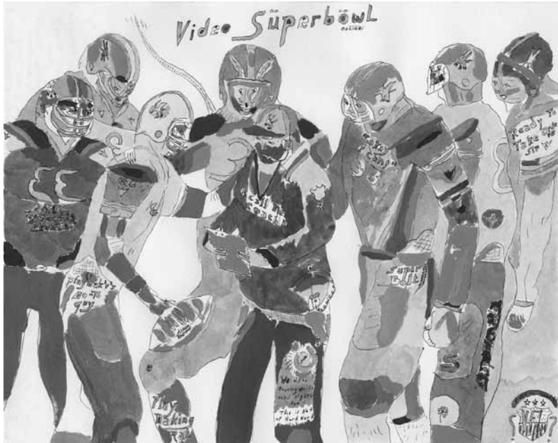
Kyle Field, Ozzy Question ? , 2008, ink, watercolor on paper, 8 3/4 x 7 inches