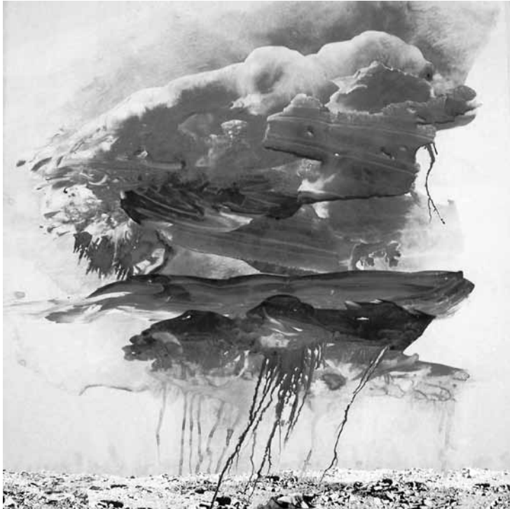
Leslie Shows, Rachel (blood) , 2008, archival inkjet with collage on rice paper, approx. 41 x 38 inches

AA: What do you expect from the exhibition?